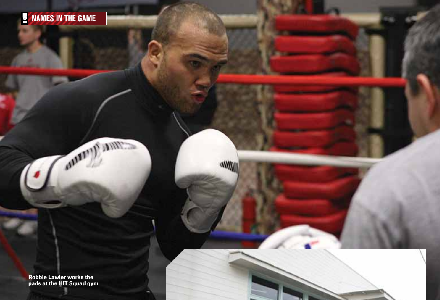
Robbie Lawler works the pads at the HIT Squad gym